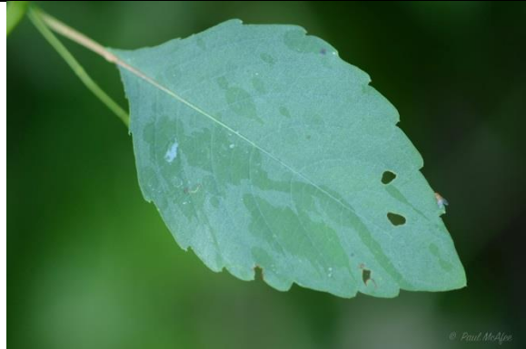
Leaves look about the same.