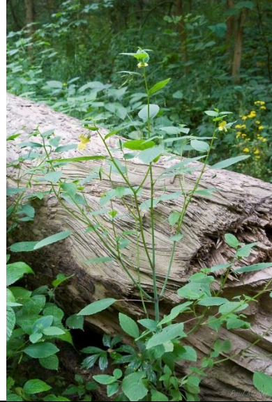
Taller plant grows singly