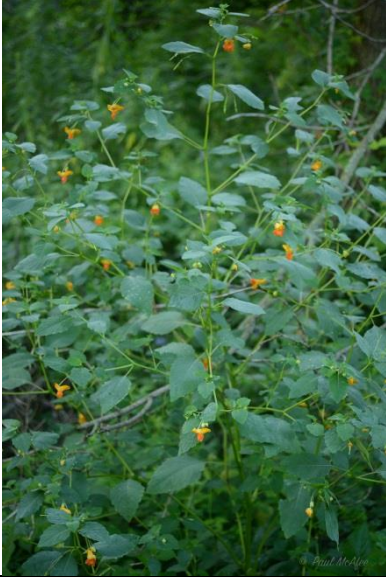
Shorter plant grows in colonies